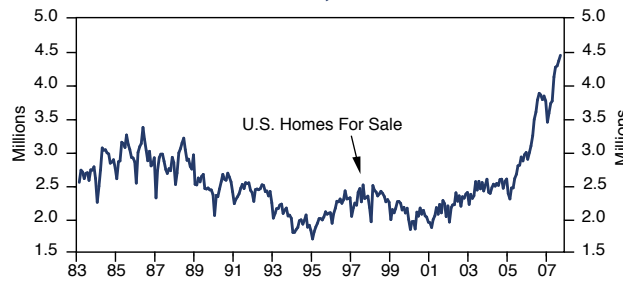
When the Offer Side of a Market Exceeds the Bid Side, Prices Fall